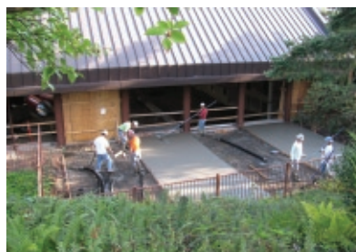
Left: Workers frame elevator shaft. Top right: Duct work system is installed on the natatorium ceiling. Bottom right: Concrete is poured on south end pool deck.