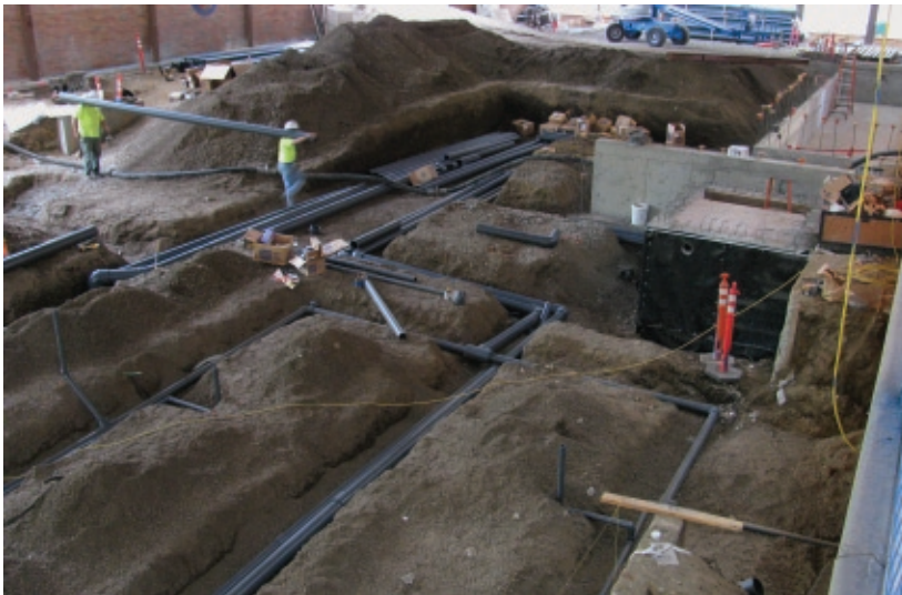
Workers lay water supply piping in trenches. The black square object on the right will be the new pool surge tank.